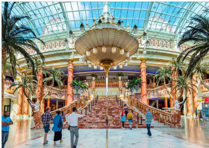
The Trafford Centre

If you are looking for places of interest to visit in Manchester after class, then the possibilities are endless. Choose to play games with your friends, shop at the local shopping centres, or take a trip to the theatre.